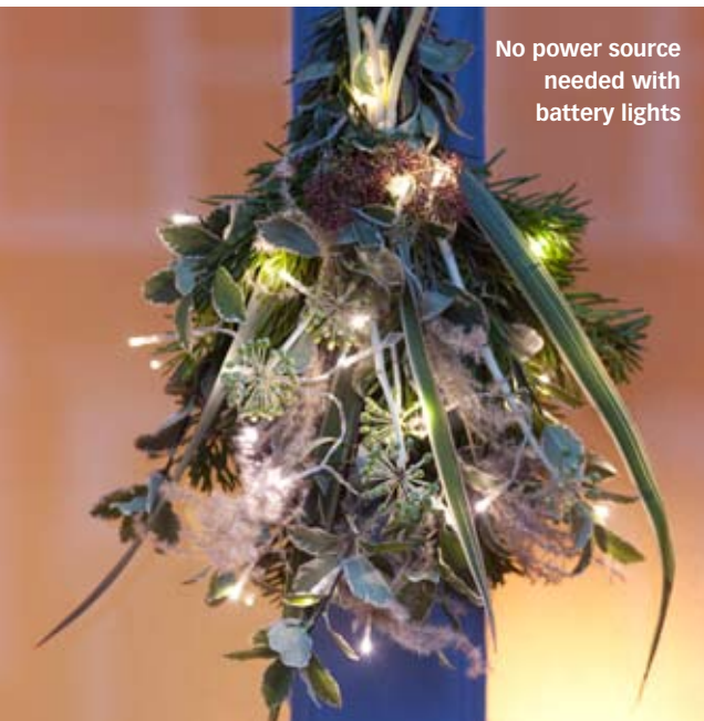
No power source needed with battery lights

Brighten up your front door with this no-fuss decoration. It will take minutes to make and you'll find most of the ingredients in your garden