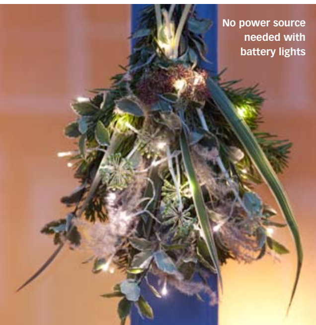
No power source needed with battery lights

Brighten up your front door with this no-fuss decoration. It will take minutes to make and you'll find most of the ingredients in your garden