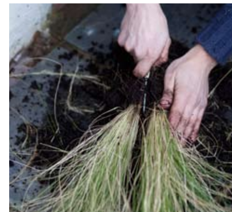
3 If the stipas are a little large make extra, smaller plants by dividing them with a sharp knife.