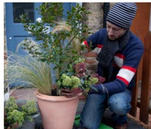
5 Add the skimmias between the stipas, backfill with more compost and water thoroughly.