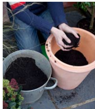
1 Add crocks to the pot, half fill with compost and pop in a slow-release fertiliser tablet.

It's vital to buy lights that are safe for outdoor use, which usually means they'll have a transformer between the plug and the first light of the string. The transformer converts the electricity to a lower voltage, suitable to use outside, and must be positioned indoors. The wire on the 'outdoor' side of the transformer will be thin enough to pass through a window or door for a limited period, while still allowing it to close. Don't plug into outdoor sockets if the transformer will be exposed.