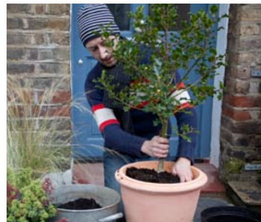
2 Position the holly in the centre of the pot, making sure it is straight, and add more compost.