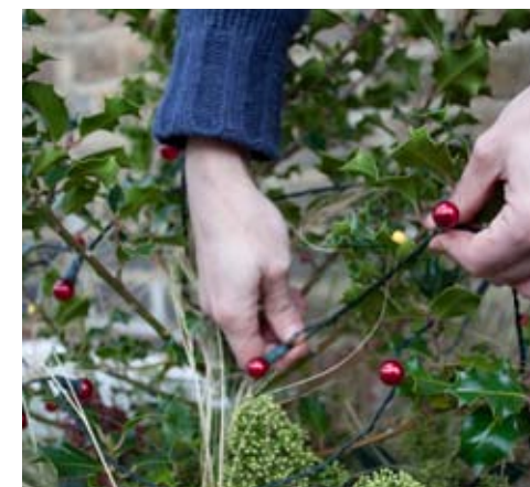
6 Twine the lights through the holly and safely connect them to your power source.