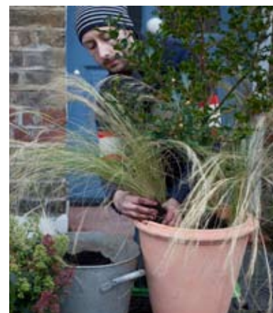
4 Plant the stipas around the edge of the container ensuring they are evenly spaced apart.